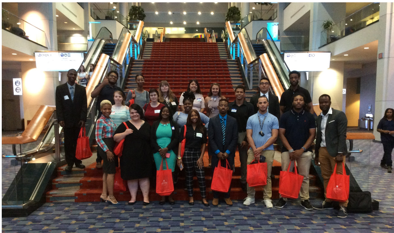
Twenty SSS participants attended the Idealist Grad Fair in Washington, D.C. in September 2019.