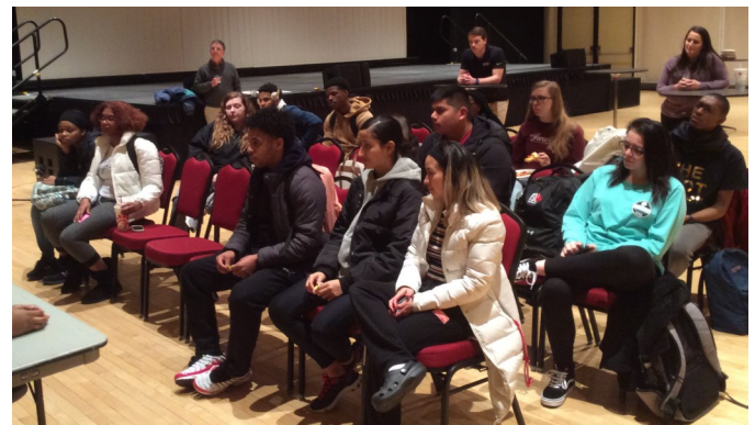
Participants at two of the centers during the event.